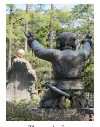
The god of marriage-making

the white rabbit of Inaba, which shows Okuninushi's deep compassion. (The story goes that a white rabbit was ill-treated by Okuninushi's mischievous brothers but then saved by Okuninushi, who was