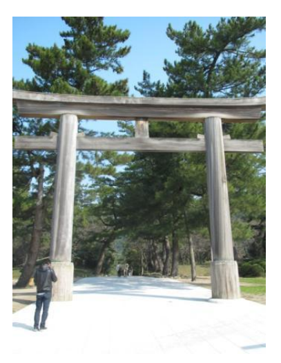
The imposing Seidamari-no-Torii gate

At the entrance to the approach to Izumo Grand Shrine, there is a towering wooden torii gateway. (This entrance is called the Seidamari, which means the "place where vigorous powers gather," because in the past it was always crowded with stages and show tents and thronging with people.) From the torii the approach, lined with pine trees and paved with stones, unusually goes downhill. On the way down, on the right there is a small shrine, called the Harai no Yashiro, where visitors can exorcize the evil spirits that have imperceptibly gathered inside them. After purifying my body and