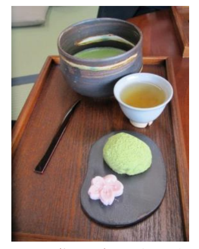
Mr. Itami's superb warabi-mochi

Glancing out of the window, I saw the castle donjon looking down on me.