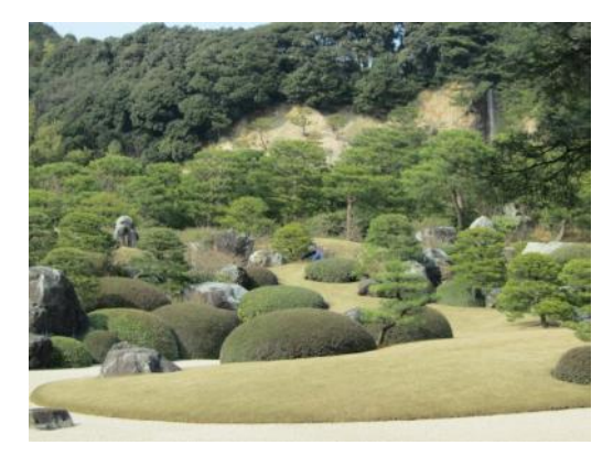
The landscape gardens reproduce the world of Japanese-style painting.

On the right Mount Kikaku, with its impressive yellowish rock face, looms behind the pine trees. The waterfall flowing down from this mountain was apparently built artificially so as to harmonize with the landscape garden. The founder endeavored to reproduce his beloved world of nihonga in the gardens, putting theory into practice as it were. The resulting delicacy and dynamism are truly awesome.