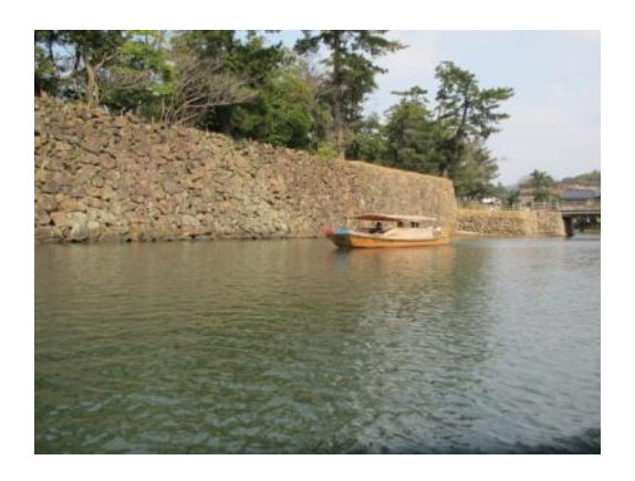
A pleasure boat plies the moat around Matsue Castle.

The symbol of Matsue, without a doubt, is Matsue Castle. Built in the early seventeenth century by the feudal lord Horio Yoshiharu, the castle is now designated as an important cultural property of the state. Samurai residences remain in the vicinity of the castle, creating a castle-town atmosphere, and visitors can enjoy the scenery from one of the pleasure boats plying the castle moat as well.