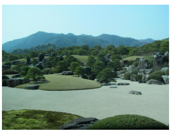
The spacious dry landscape garden

Next, departing from the world of myths, I visited Adachi Museum of Art in the city of Yasugi. This museum houses the collection of about 1,500 paintings of the founder, Zenko Adachi (1899–1990), including many modern and contemporary nihonga (Japanese-style paintings). The exhibited works are seasonally changed. The paintings, centered on the works of Taikan Yokoyama (1868–1958), are indeed wonderful, but so also are the museum's Japanese-style landscape gardens, built passionately by the founder himself in the belief that "a garden is also a work of art." An American magazine about Japanese gardening has designated the gardens at the Adachi Museum of Art as the best in Japan for nine consecutive years since 2003. They are also introduced in the Michelin Green Guide , which gives them a three-star rating.