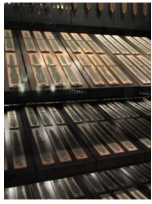
Many bronze swords were discovered.

various theories about the main hall's shape, and the museum has several models reflecting them. In the Heian and Kamakura periods the main hall was twice the size of the present structure; there is even a theory that the ancient hall towered as high as 96 meters.