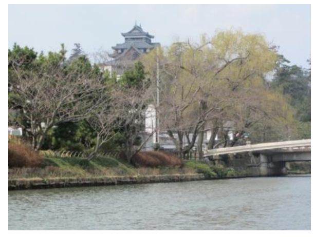
Matsue Castle looks especially grand when seen from the boat

The leisurely boat ride takes just less than one hour and goes past places you would not otherwise have the chance to see. It's definitely worth doing!