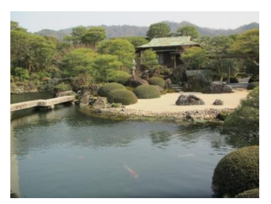
The pond garden lubricates the mind.

In the innermost part of Adachi Museum of Art there are two more quite different gardens, which,