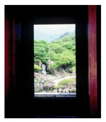
This cutout makes the garden look just like a hanging scroll.

Farther along there is a place where visitors are almost automatically stopped in their tracks. It is a scene of the garden framed by a window. Be it a dry landscape garden or a white gravel and pine garden, a sliver cut out in the shape of a window frame or alcove radiates a completely different kind of elegance from that of the overall view. Quite unlike the beauty of the overall garden blending with nature, this scene has the beauty of a painting in which the silhouettes of the trees in the foreground create a special accent and perspective and more emphasis is given to light and shade.