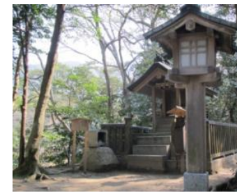
Harai no Yashiro

soul here, I carried on along the approach.