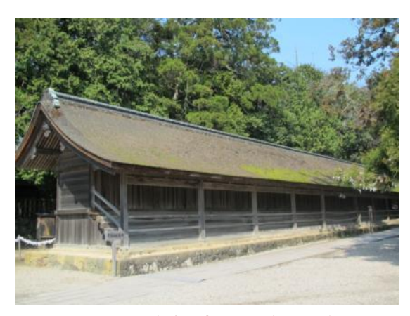
Accommodation for countless gods

There are two things of interest in the vicinity of the main hall. The first is the spot where three giant pillars, thought to have supported the main hall in the past, were excavated in 2000. They are said to lend credence to the theory that in the Heian period (794–1185) the main hall reached a height of 48 meters, twice the size of the present structure.