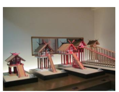
Models show how the great hall might have looked.

The first exhibit features the huge wooden pillars that were excavated in front of the main hall of Izumo Grand Shrine in 2000 and are thought to have been used in the construction of the main hall in the early Kamakura