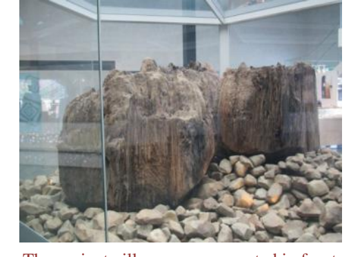
These giant pillars were excavated in front of the main hall.

Until 2000 it had been widely argued that construction of a huge structure rising to a height of 48 meters would have been impossible with the technology available at that time, but the discovery gave credence to the theory. If the 48-meter-high hall really did exist, it would have been taller than the Great Buddha hall at Todai-ji temple in Nara and the highest structure in Japan at that time.