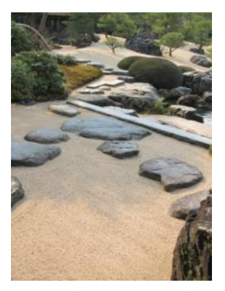
The white gravel and pine garden

Finally, after enjoying the sense of liberation that comes with being outdoors and feeling even more the blessings of nature, I went up to the exhibition room on the second floor to enjoy the world of nihonga . The idea of guiding visitors through the gardens first and then into the world of nihonga is superb.